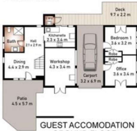
GUEST ACCOMODATION GROUND FLOOR